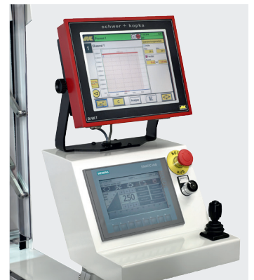
Press Control with Schwer+Kopka force / stroke measurement system